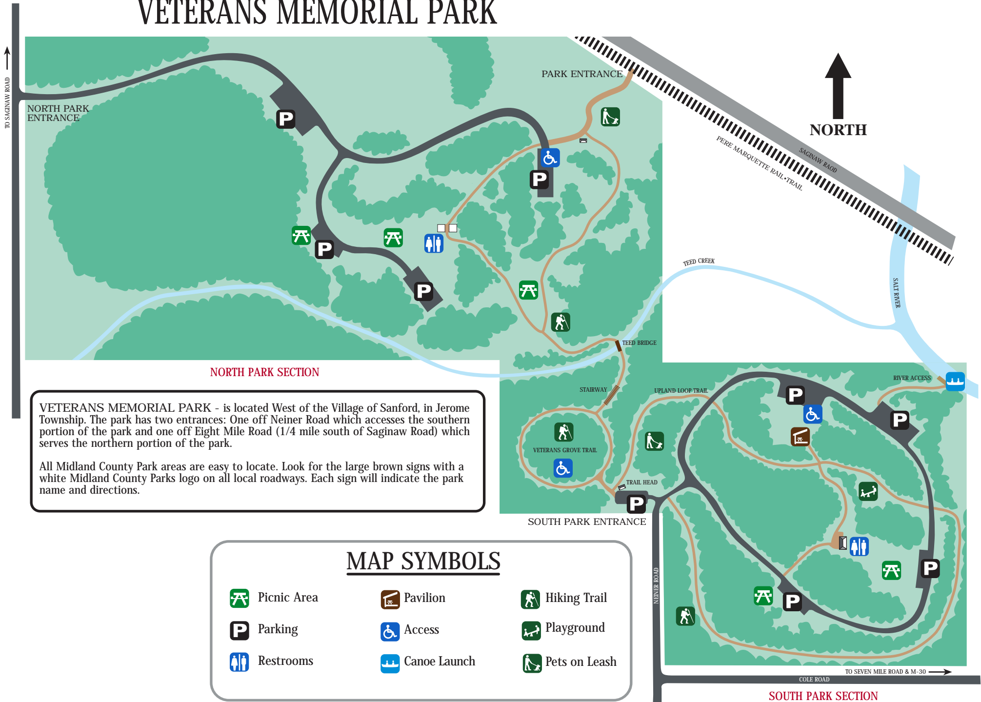
NORTH PARK SECTION